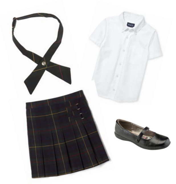
Girls' Monday Uniform