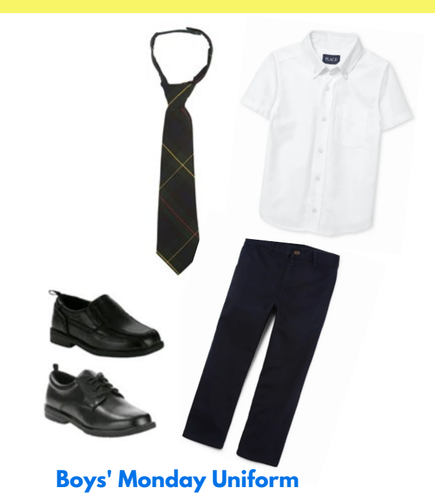
Monday - "Warrior Day"

Students wear a White Button-down Collar shirt w/School logo. Shirts can be Short-sleeve or Long-sleeve.